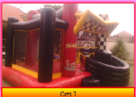
Cars 1 R650 4.5m x 5m